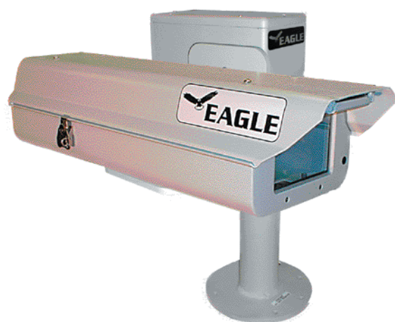
Eagle PTE-350 Pan Tilt head shown with optional PT-EE-L housing

The EAGLE® PTE-350 pan-tilt head is a heavy-duty, easy to use unit. It is designed for use in many areas, some of which are remote traffic monitoring, remote news gathering for television broadcast, and entertainment venues.